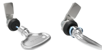
Insert key to depress shutter and rotate cam